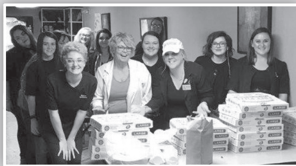
Some of our Friends at Black Hills Beauty College.