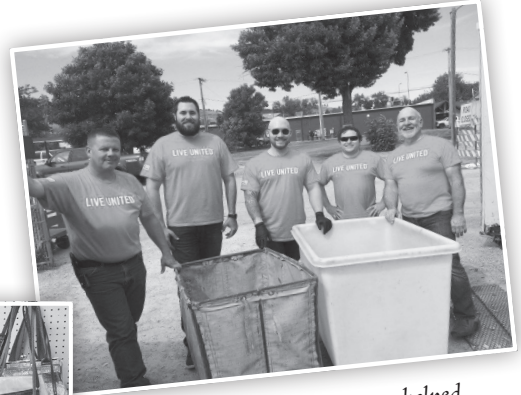
Highmark Credit Union guys helped in the back lot of the Thrift Store.