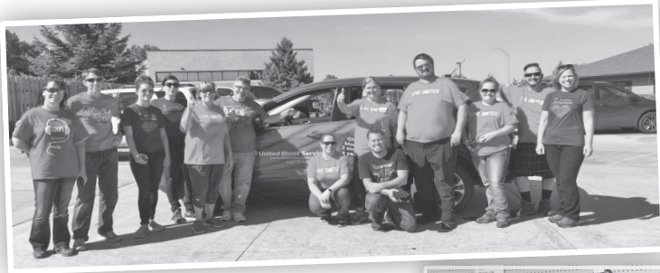
The group from United Blood Services did yard work at the Women & Children's Home.

Every year we are blessed to have a couple groups from United Way Day of Caring help us out at Cornerstone. This year we had a group from Highmark Credit Union working in the Thrift Store and a group from United Blood Services that did some yard work at the Women & Children's Home. The help from these groups is always appreciated and we thank them for taking time out of their busy schedules to volunteer at our facilities!