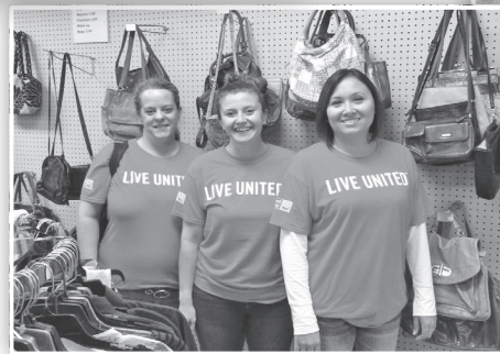
Highmark Credit Union ladies helped organize clothes in the Thrift Store.